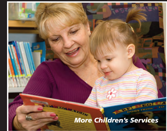
More Children's Services